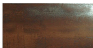
TITANIUM 3060NR ÓXIDO | 30x60 cm | B28 C