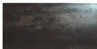
TITANIUM 3060NR NEGRO | 30x60 cm | B28 C